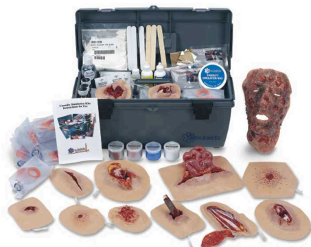
025 Xtreme Moulage Kit