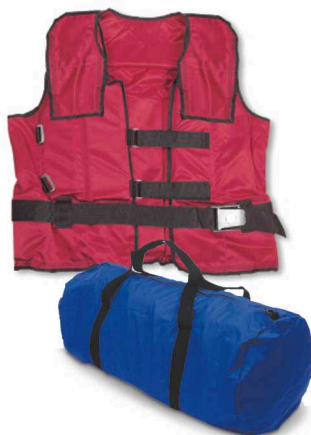
1118 Weighted Vest and 2094 Carry Bag