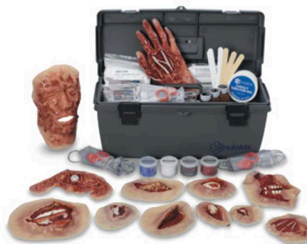
620 Xtreme Moulage Kit