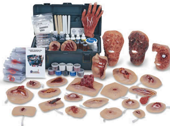
028 Xtreme Moulage Kit